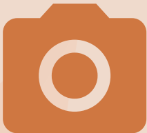
PHOTO SCAVENGER HUNT

The event is free, but snacks and beverages will be available for purchase. For lego and pumpkin contest information, view the page below.